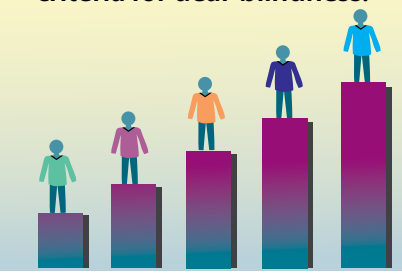
Adapted from the Virginia Project Children and Young Adults With Deaf-Blindness

Pennsylvania is federally required to keep a record of every school-age student in the state who meets the criteria for deaf-blindness.